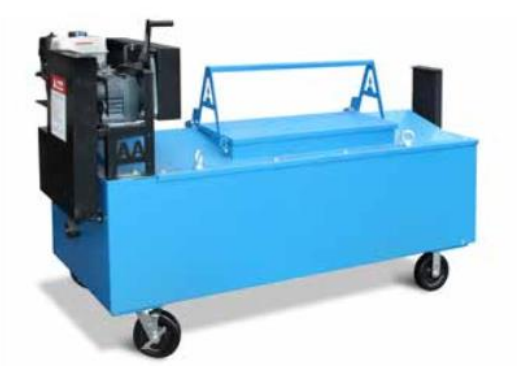
Double Jacketed Melter

Probably the most important factor in assuring that the concrete will attain its full strength and durability is to ensure it is properly cured. There are several curing methods that are acceptable to Hydrotech, including water curing, wet coverings, plastic sheets and liquid applied curing compounds.