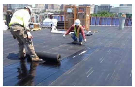
Protection sheets installed

Stone/Gravel Ballast: In a stone or gravel ballasted PMR Assembly, properly sized aggregate is installed at the weight and depth required, per DuPONT's ballast wind design guidelines, based on each roofs specific requirements. Typically, more ballast will be required at the corners and perimeters of a roof, where the wind uplift forces are greater than in the field of the roof. Typically requires crushed, graded stone placed over a stone filter sheet, rolled out over the insulation. In the field of the roof, a minimum of 48.8 kg/m² (10 lb/pi²) ballast is required, with 97.6 kg/m² (20 lb/pi²) needed at perimeters and at large penetration.