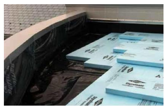
DuPONT STYROFOAM™ insulation