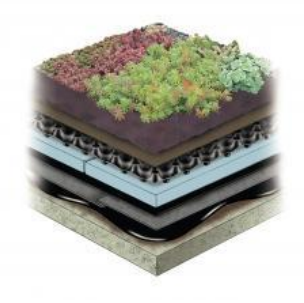
Ballast Garden Roof® Assembly

Hydrotech's Garden Roof Assembly takes the PMR roof to the next logical level - a vegetative roof. Reducing the urban heat island effect as well as a solution for stormwater management are only two benefits (of many) this assembly provides. This is responsible, sustainable architecture whose time is here.