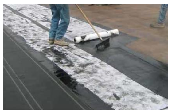
Monolithic Membrane 6125 Application