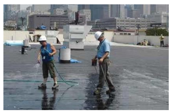
Electric conductivity testing