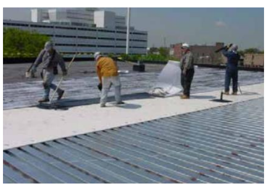
USG Securock Over Metal Deck Substrate