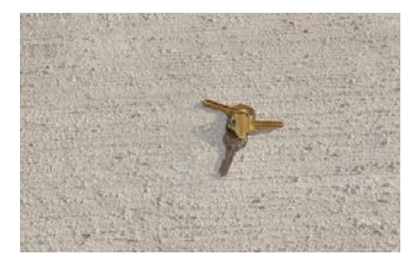
Concrete finishing - wood trowe

Maintain [the vapor barrier] [and] [air barrier] continuity of the building envelope with the roof membrane.