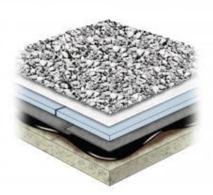
Stone/Gravel Ballast installed