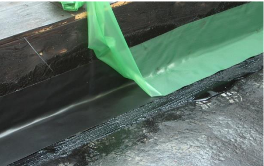
Details are made firs