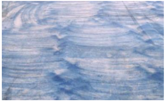
Surface conditioner application

Once the details are complete, the MM6125 membrane can be installed on the deck, completely overlapping the details. An initial layer of rubberized asphalt membrane should be applied continuously to the concrete at an average thickness of 3 mm. Completely cover the initial membrane layer with a 1000 mm wide fabric reinforcement, taking care to overlap each joint by at least 50 mm. Subsequently, cover the fabric with a final layer of membrane with a thickness of 3 mm. The upper layer of membrane should be applied on the fabric, the same day.