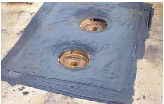
Details are made first.