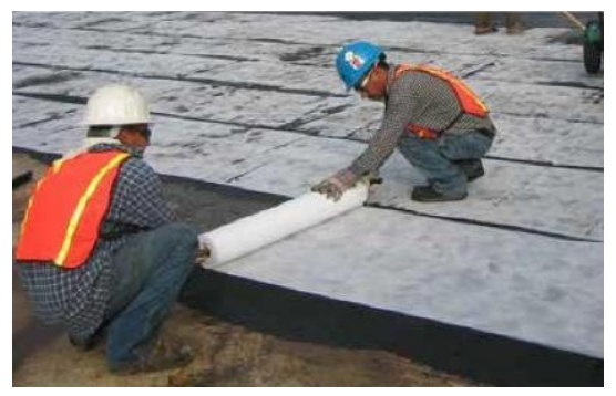
Monolithic Membrane 6125 Application